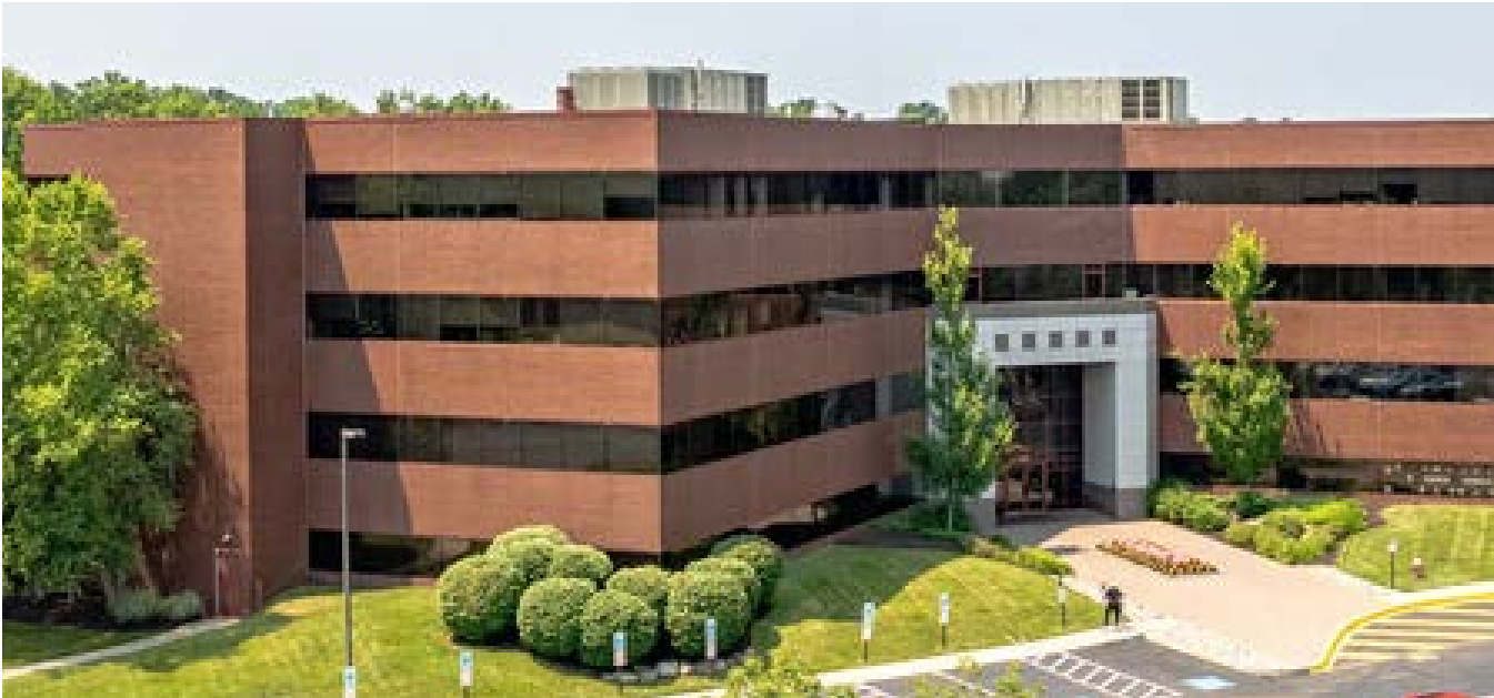
Global Headquarters: Newtown, PA, USA